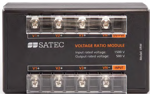
Figure 2: VRM Module